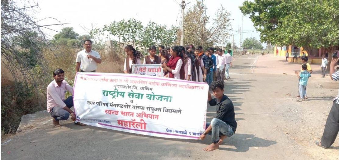
2018, Time: 11.00 am